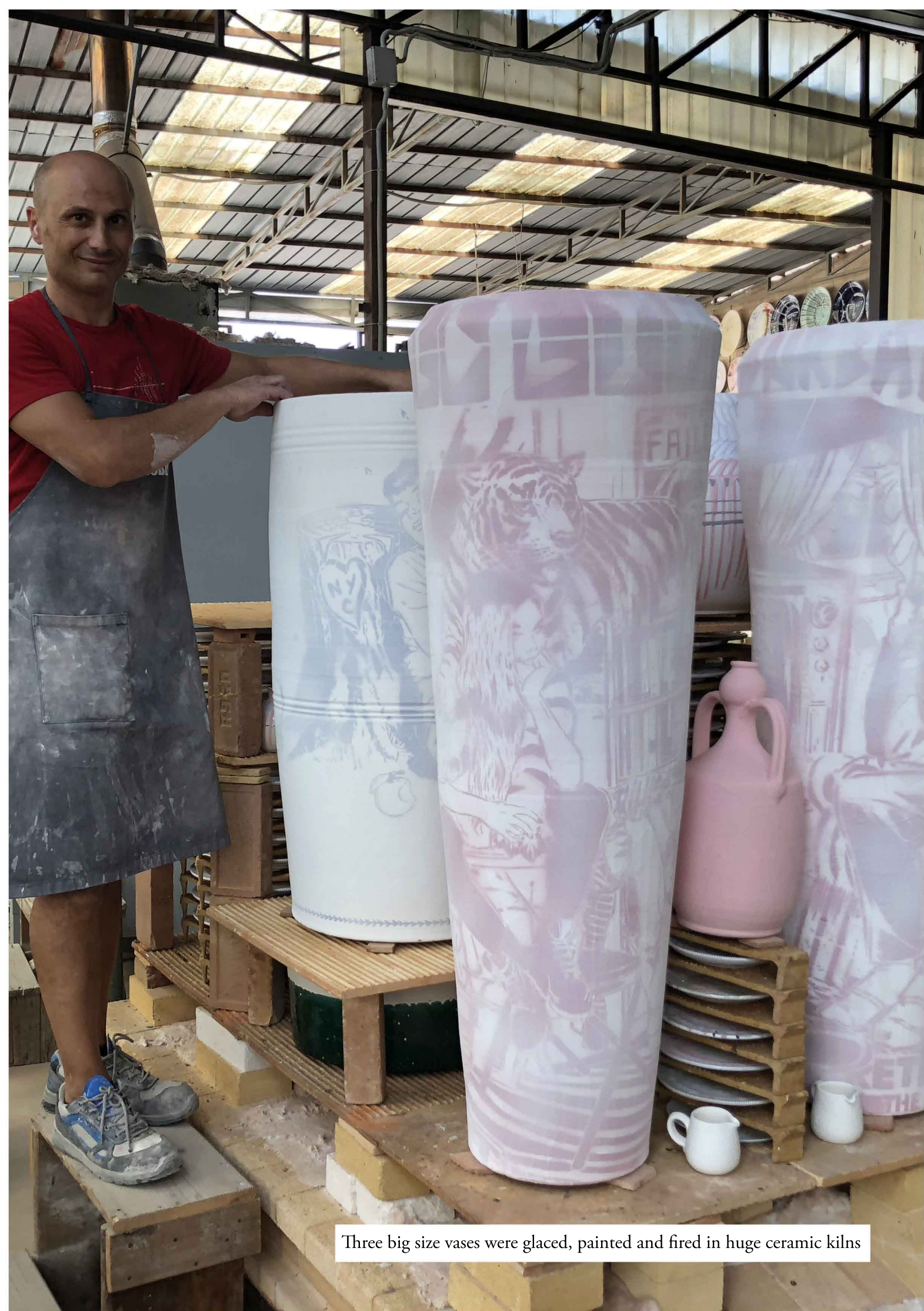
Three big size vases were glazed, painted and fired in huge ceramic kilns