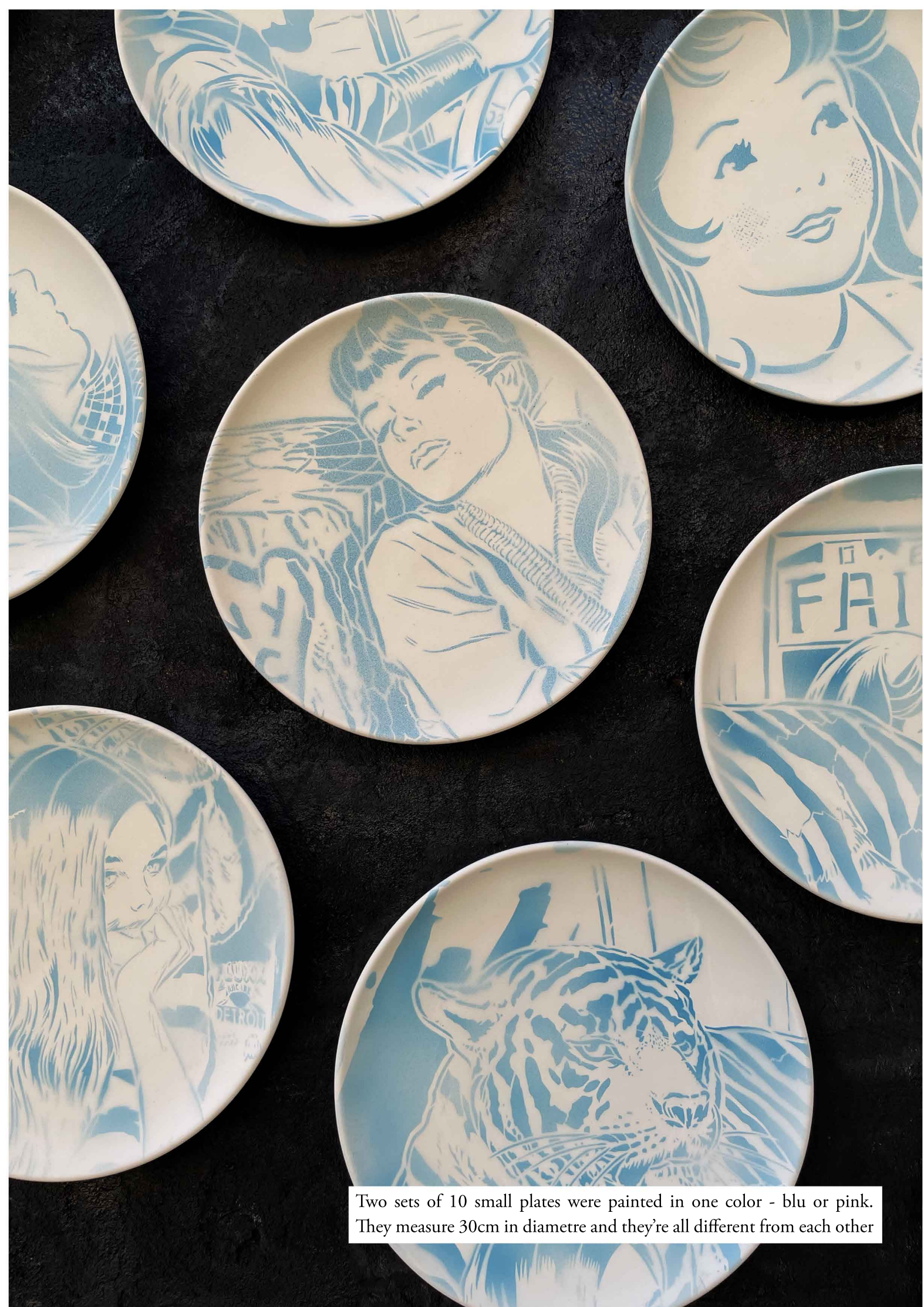
Two sets of 10 small plates were painted in one color - blu or pink. They measure 30cm in diametre and they're all different from each other