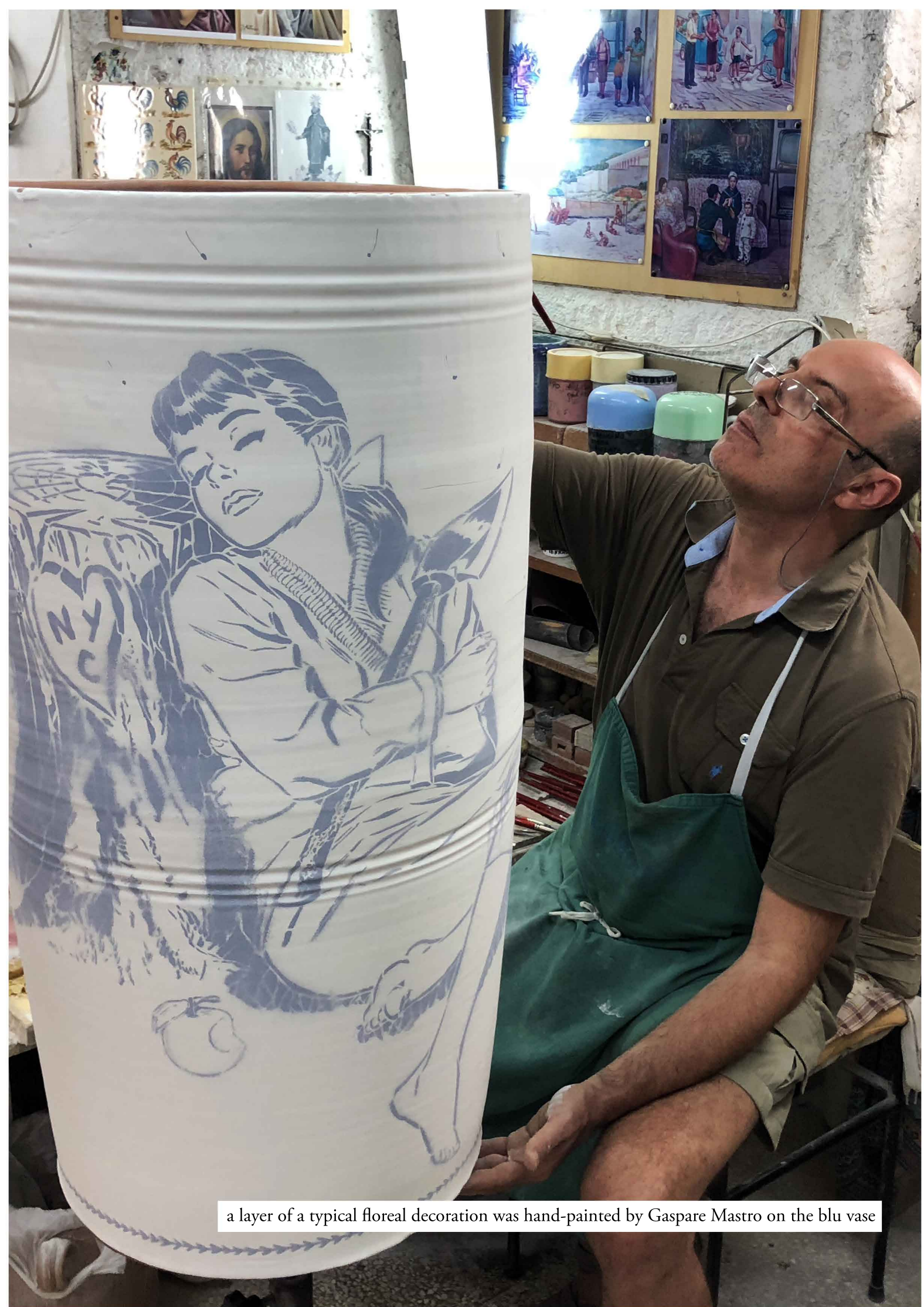
a layer of a typical floreal decoration was hand-painted by Gaspare Mastro on the blu vase